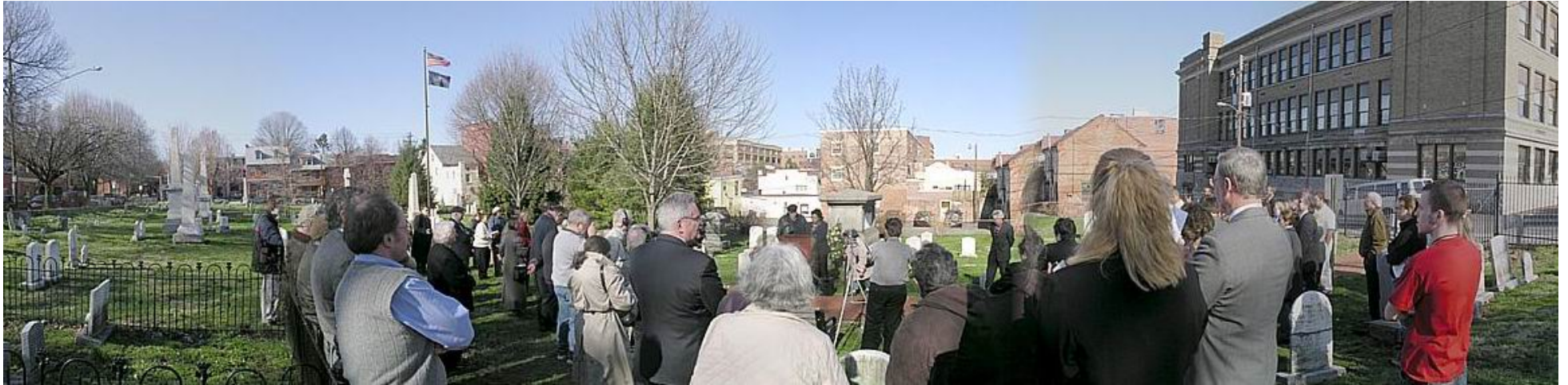
Annual birthday commemoration at Stevens' gravesite sponsored by Thaddeus Stevens College of Technology, Lancaster, PA, April 4, 2005